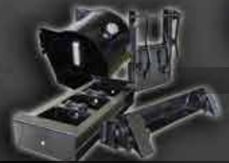
S, M & H SERIES ACCESSORIES