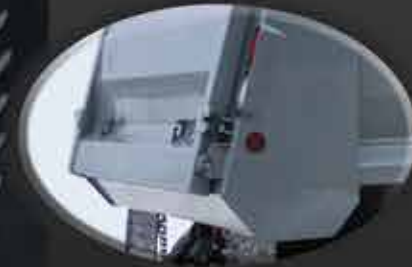
ASPHALT TAIL (45°)