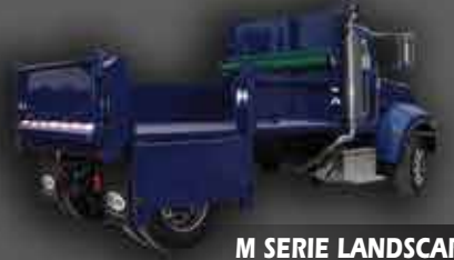
M SERIE LANDSCAPING DUMPBODY