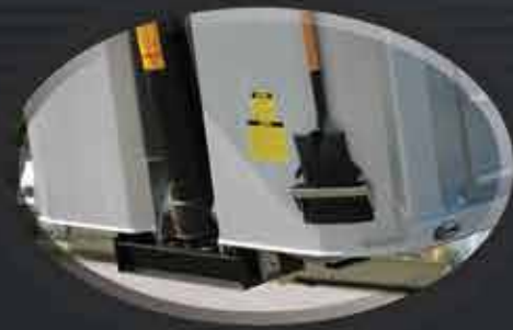
CYLINDER BLOCK SYSTEM