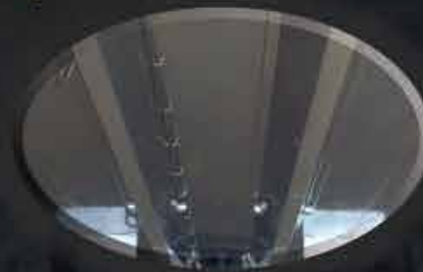
MONOCOQUE DESIGN CROSSMEMBERLESS SUBFRAME