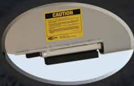
RUBBER MOUNT ISOLATION SYSTEM