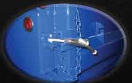
TAILGATE SAFETY LOCK