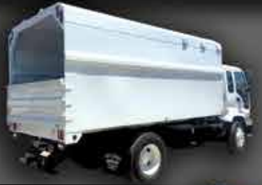
C SERIE CHIPPER BODY