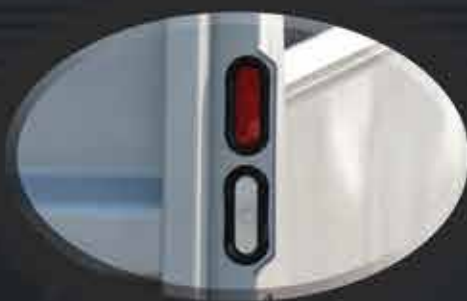
REAR LIGHTS HOLES ARE ENGINEERED TO GIVE BETTER VISIBILITY