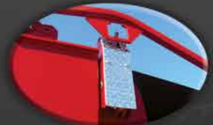
AIR LOCK TARP SYSTEM