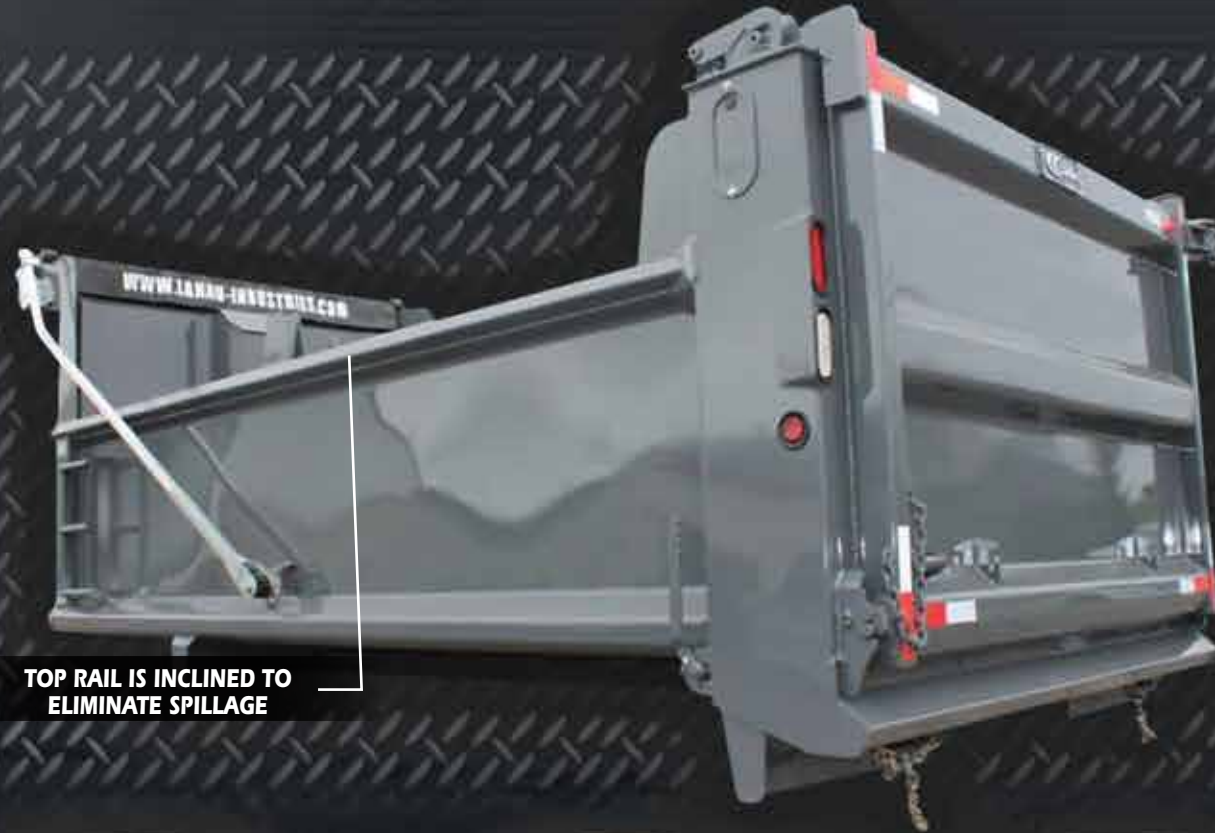
TOP RAIL IS INCLINED TO ELIMINATE SPILLAGE