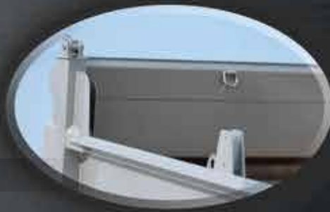
FRONT & REAR SIDEBORD EXTENSION POCKET