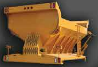
H SERIE HOPPER SPREADER