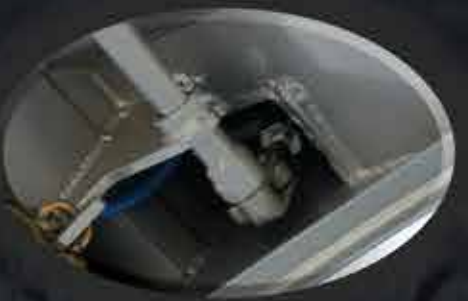
ZINC CHROMATED TAILGATE LATCH