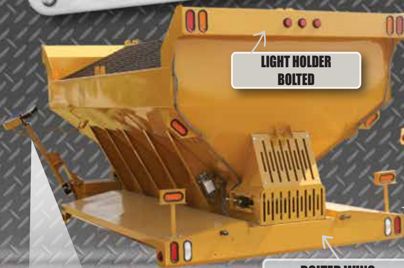
LIGHT HOLDER BOLTED