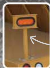
MUNICIPAL LIGHT BOLTED